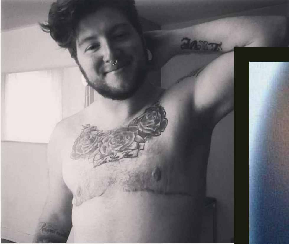
6 months post-op; 4.5 years HRT